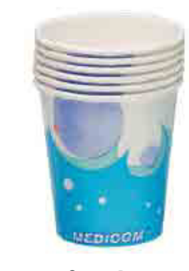
Plastic Coated Paper